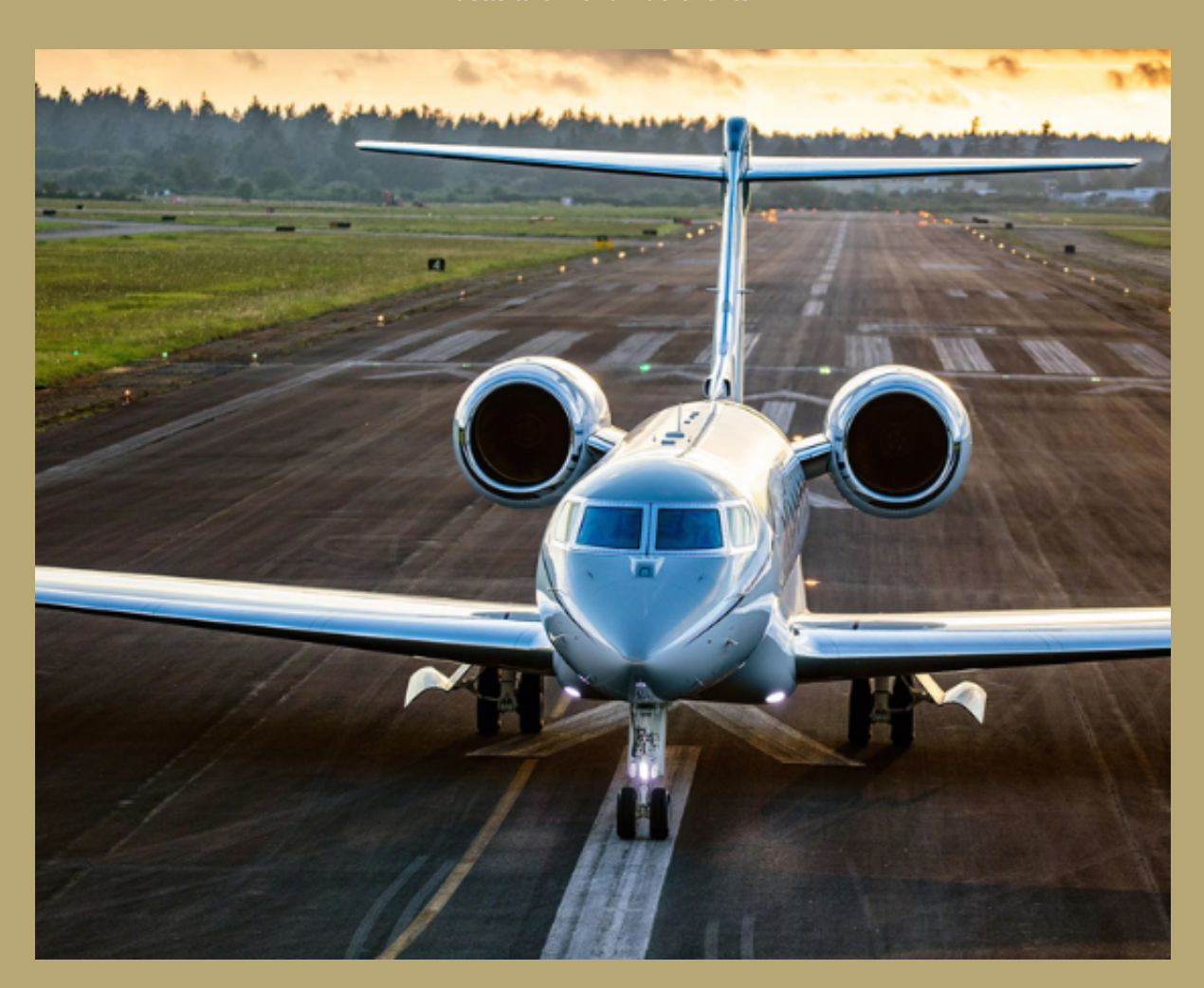
Gulfstream G600 Awarded Steep-Approach Certification By The FAA

A round-up of this month's most popular articles from our own journal of industry news, inspirational ideas and worldwide events.