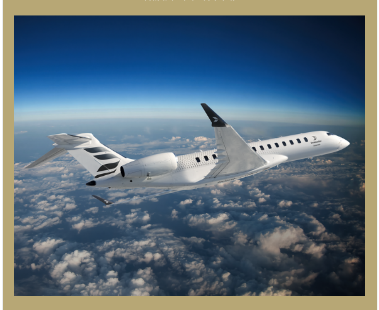
The World's Longest Range Business Jet?

A round-up of this month's most popular articles from our own journal of industry news, inspirational ideas and worldwide events.